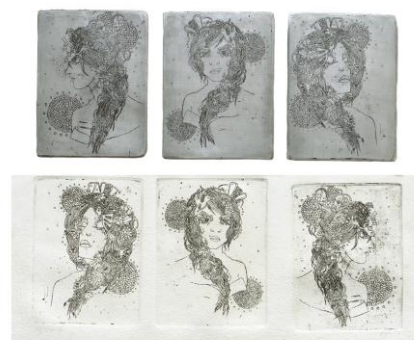
Rhea Jindal Etching