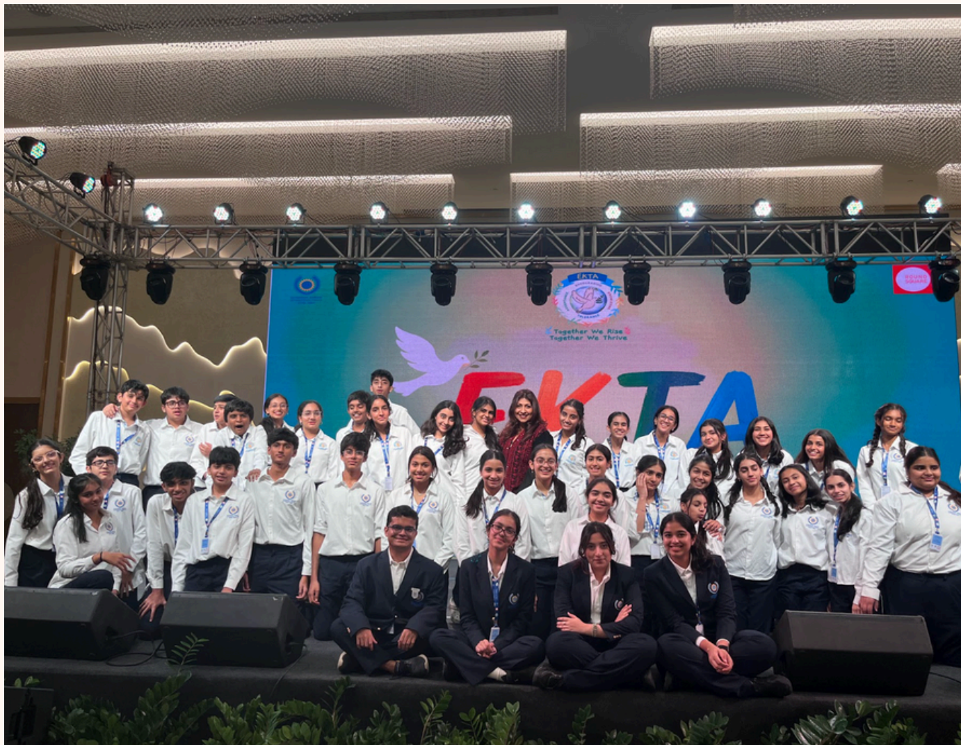
The EKTA Student Team